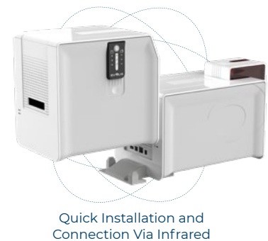
Quick Installation and Connection Via Infrared